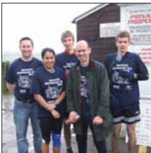
After 13 miles of mud, sweat and tears Greenhead Harriers' finest bask in the glory of a successful half marathon.

On 2nd April an elite band of athletes competed in the Baildon Boundary Way Half Marathon. The gruelling, hilly course was made even more demanding by earlier heavy rain which caused the majority of the 13 mile course to be ankle-deep in mud.