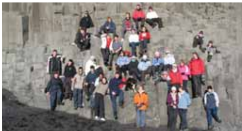
Iceland team, on the rocks ...