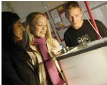
Physics students using the new ripple tank.