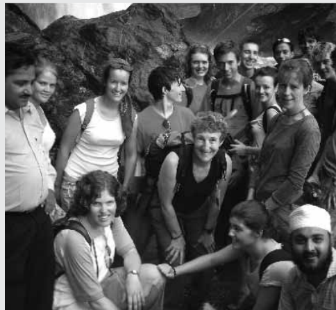
The group meet the locals in Manali