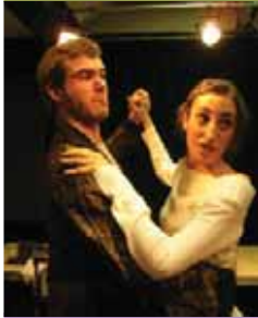
Higgins & Mrs Pearce