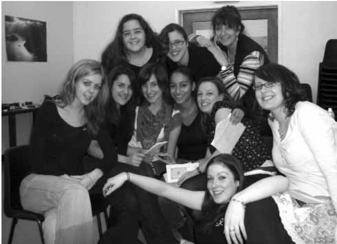
The My Fair Lady Make Up/Hair Design Team