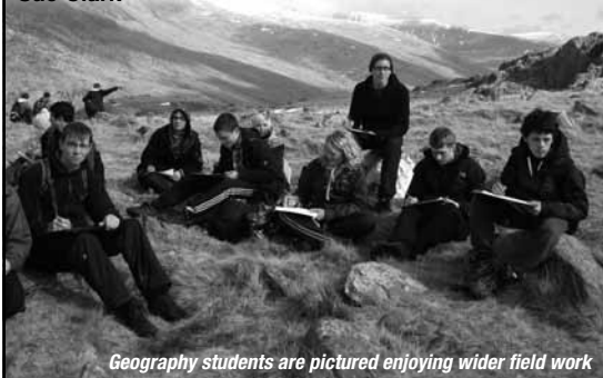
Geography students are pictured enjoying wider field work