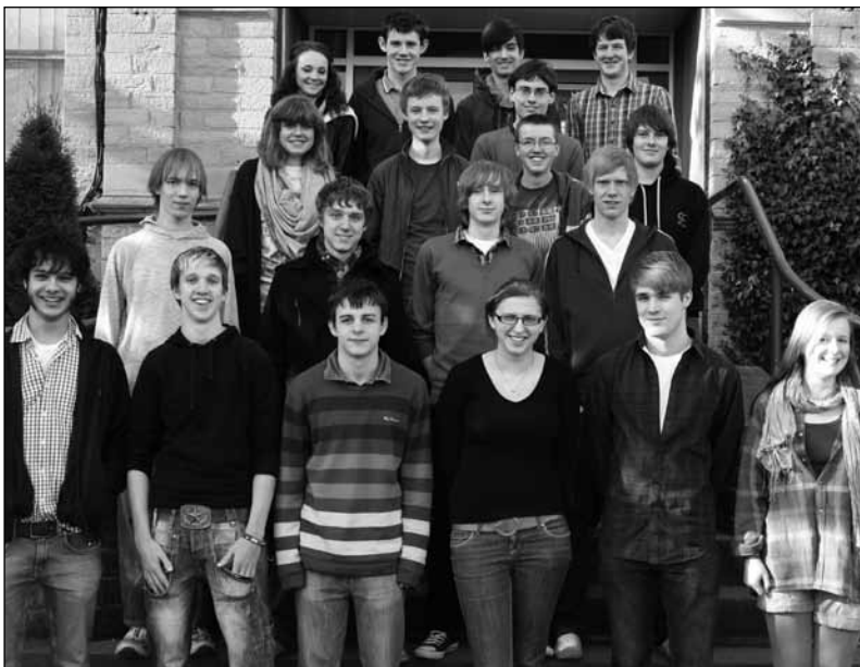
This year's successful Oxbridge applicants

They include 20 offers to read for degrees at the Universities of Oxford and Cambridge. These Oxbridge offers add to the many Greenhead students have achieved over the last 15 years with 131 offers being made in the last five years. At a time when the number of applicants is increasing to these Universities our 'hit-rate' during recent years is better than the national average. The offers achieved by our students reflect achievement by all departments at the College, and their former High Schools.