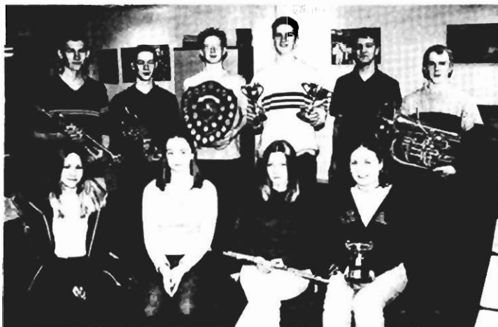
Successful Mrs Sunderland competitors with instruments and trophies.