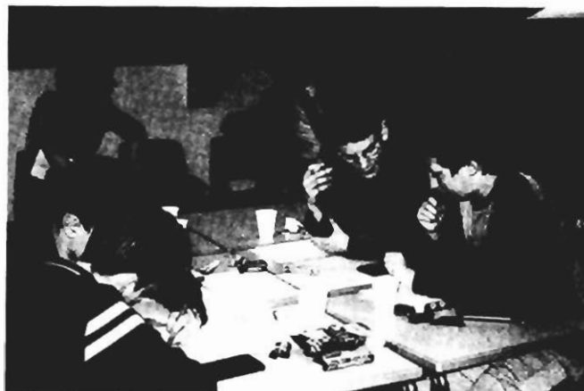
Competitors puzzling out solutions