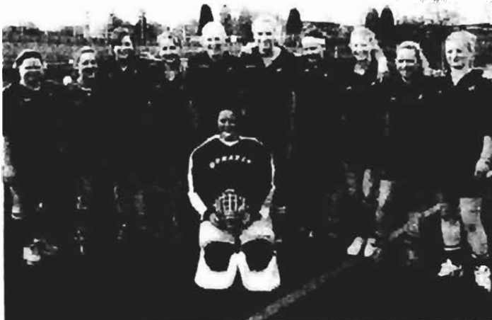
The Girls' Hockey Team