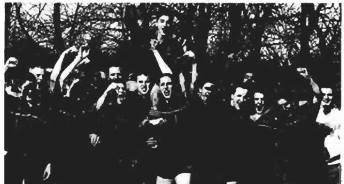
British Colleges Seven-a-Side Rugby Competition Wednesday, 5th March

Congratulations to all the team on a great season. CA