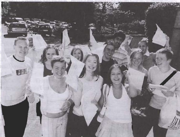
Happy Greenhead students on Results Day in August

There is one person, at least, worried about the good news – the Principal. Every year the Governing Body ask the Principal to predict the A-level results for the current students, and, of course, improvement is expected. Last year, with the newness of 'curriculum 2000', there was an excuse to be cautious, but does this year's success mean we are now looking towards a 100% pass rate? Our students are certainly capable of it!