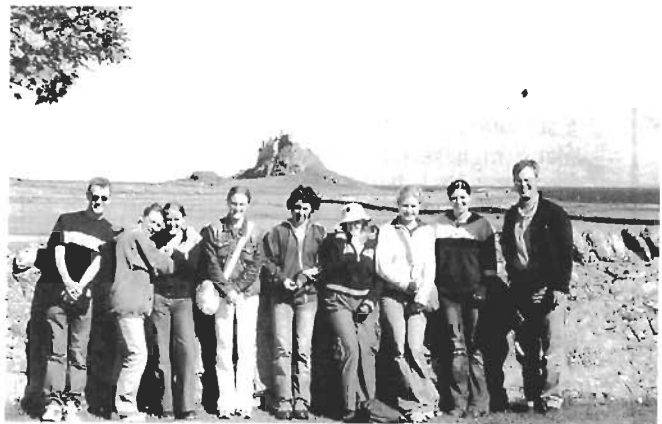
Relaxing in Northumberland

Everybody who took part in this project thoroughly enjoyed it. It was a fun and relaxing activity to end our AS examinations. I would recommend it to next year's AS students. Remember: the next time you find yourself on a minibus, at some ridiculous hour of the morning, with eight strangers, it is not necessarily a bad thing!