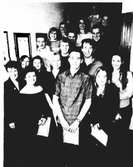
Some of the Gold Award Winners at Huddersfield Town Hall