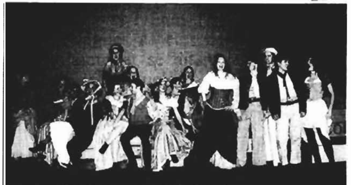
The Docks: The Lovely Ladies and the Sailors