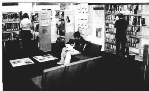
The newly-expanded Careers Library