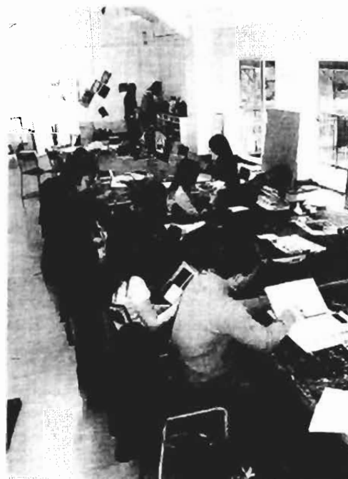
One of the spacious Art studios on the top floor

The Art department occupies the third floor, from which rooms there are spectacular views across rooftops to Emley Moor and Castle Hill in the distance. There are two huge studios, exhibition and storage space, plus a dark room. An Art student declared the new rooms: "light, airy, inspirational, really". Really!