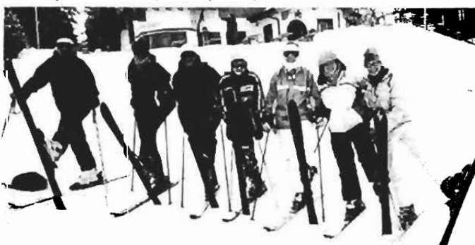
Greenhead skiers put their best feet forward in Kitzbuhel