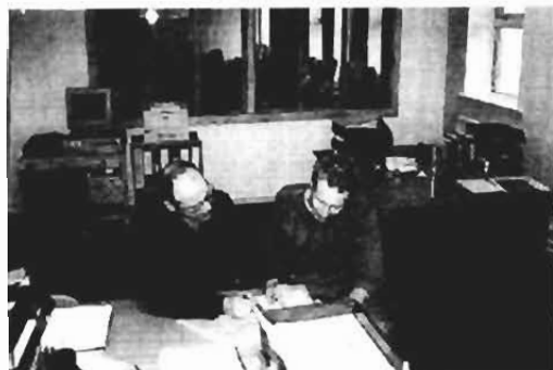
A new Law classroom on the second floor